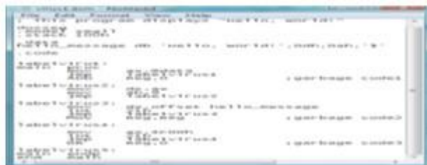
Figure 1: Assembly code of Virus File

The mutating behaviour of metamorphic viruses is due to their adoption of code obfuscation techniques like dead code insertion, Variable Renaming, Break and join transformation. Figure 1 shows the assembly file of the virus code. Computer viruses like polymorphic viruses and metamorphic viruses use more efficient techniques for their evolution so it is required to use strong models for understanding their evolution and then apply detection followed by the process of removal. Code Emulation is one of the strongest ways to analyze computer viruses but the anti-emulation activities made by virus designers are also active [4][5][6][7][8].